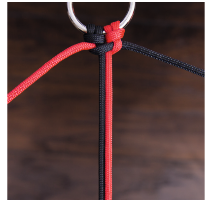
anziehen und wiederholen ab 1a